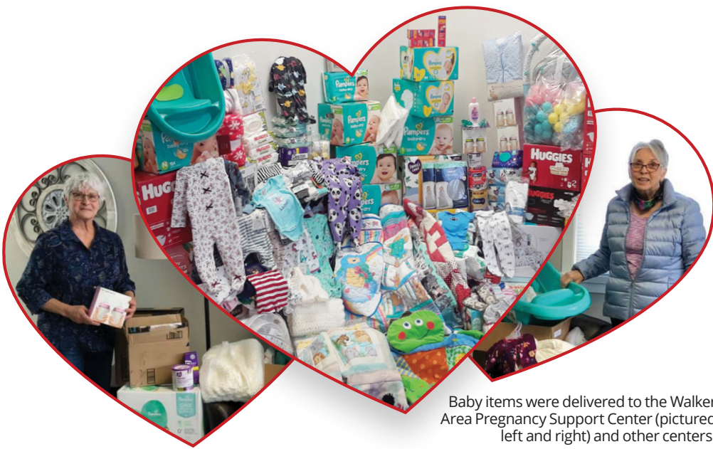
Baby items were delivered to the Walker Area Pregnancy Support Center (pictured left and right) and other centers.