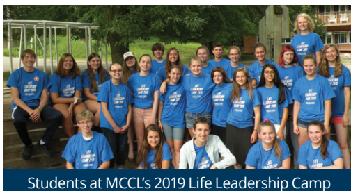
Students at MCCL's 2019 Life Leadership Camp

Because, in addition to educating, we are involved in working for legislation to protect human life, donations to MCCL, Inc., are not deductible as charitable contributions for income tax purposes.