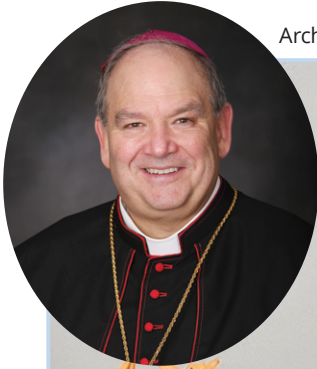
Archbishop Hebda